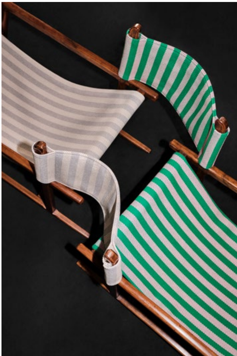
Voulez-vous, Striped twill , col. 4 Sambuco, 5 Fragola menta