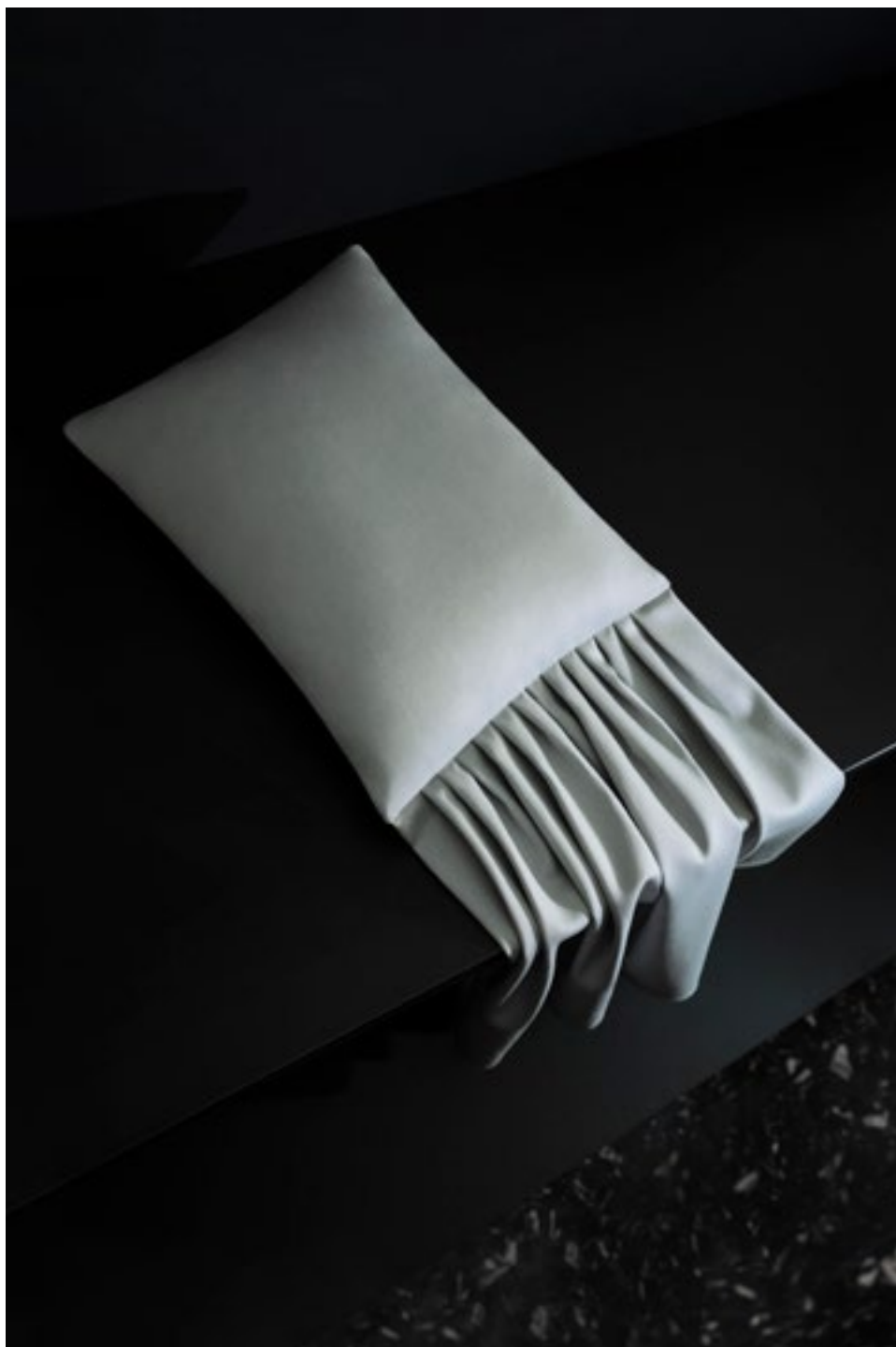
Aplomb, Wool satin , col. 35 Celadon