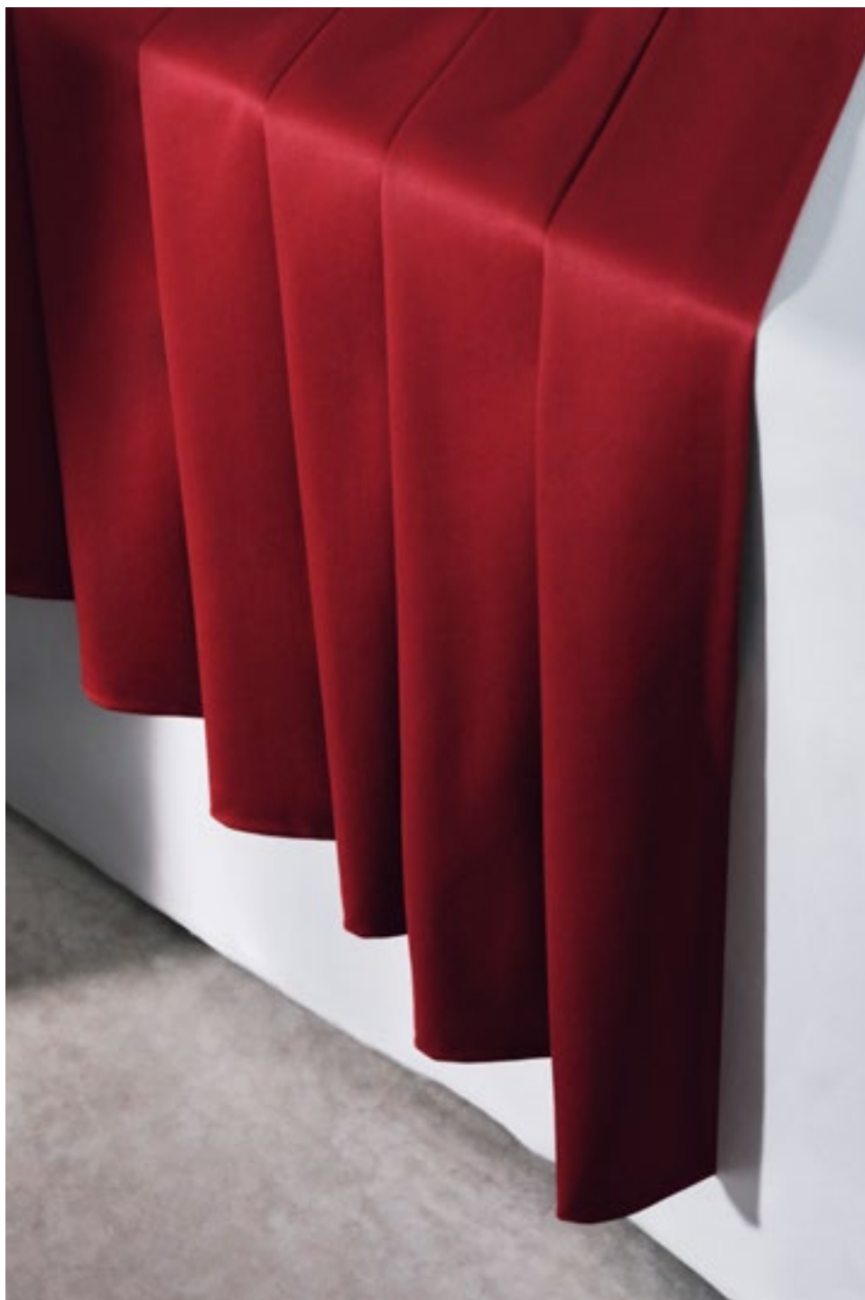
Aplomb, Wool satin , col. 41 Cerise