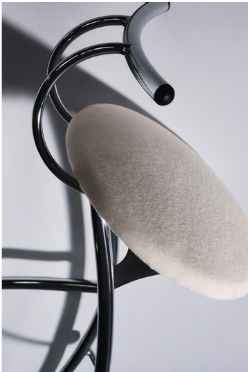
Adorable Alpaca, Alpaca velour , col. 4 Banguise