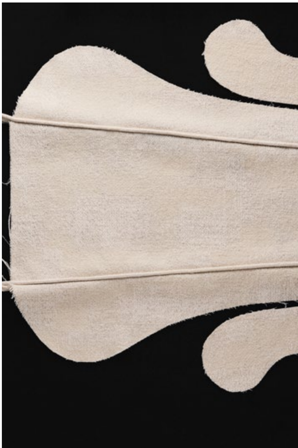
Laszlo, Textural abstract pattern white on white , col. I Calcare