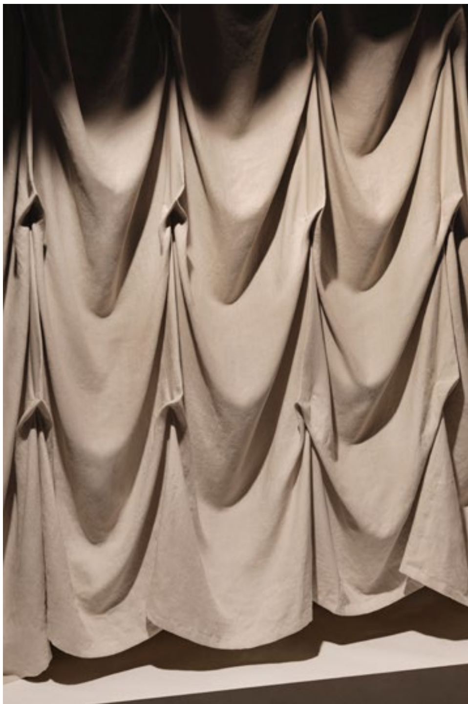
Wide Linen Sablé Leggero, Lightweight linen sablé in extra-width , col. 2