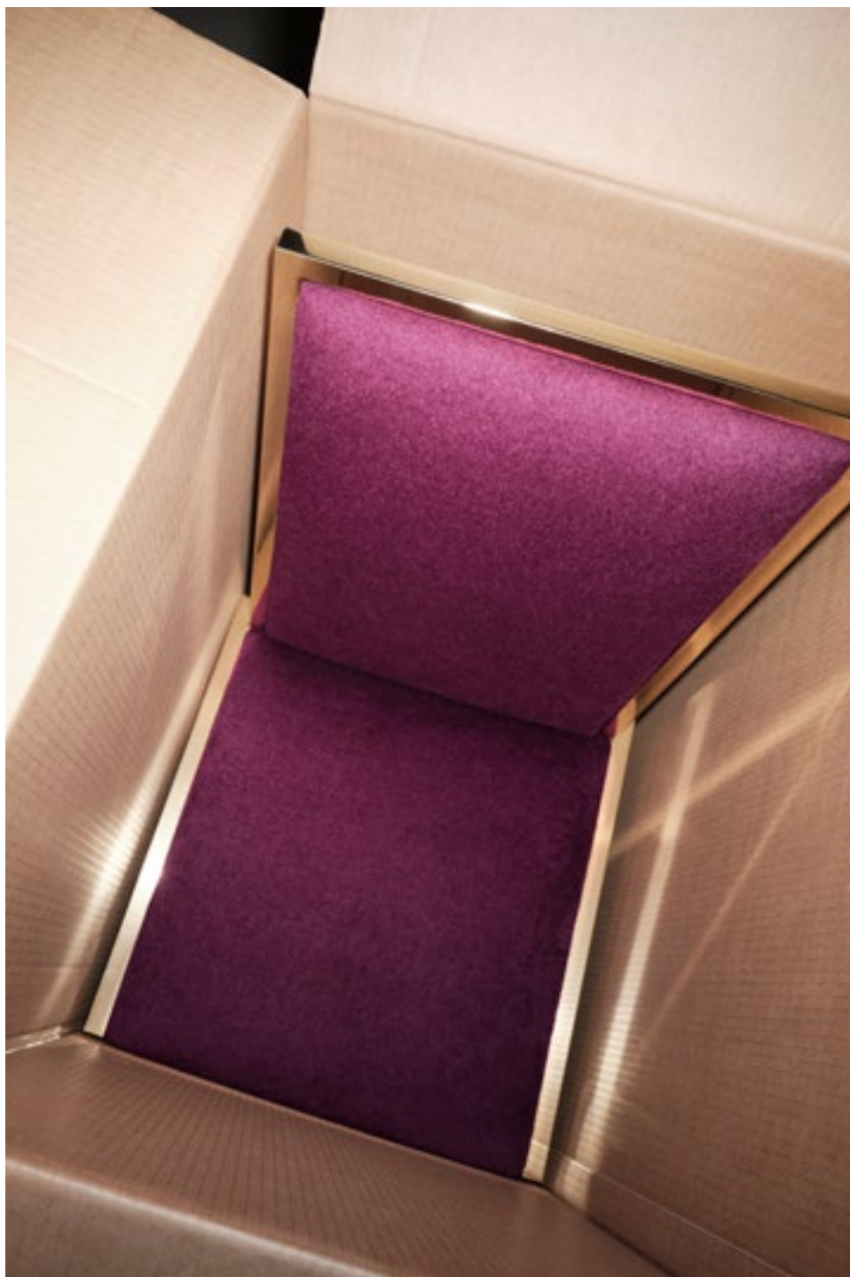
Adorabile Alpaca, Alpaca velour , col. 13 Prugna