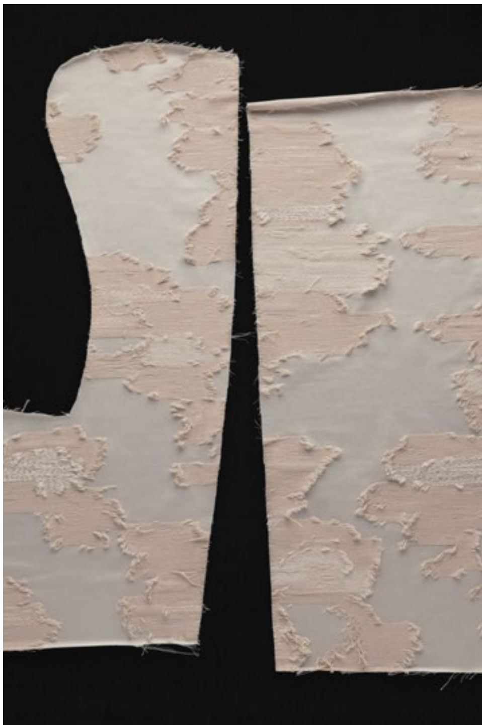
Calicanto, Abstract lampas white-on-white , col. 1 Impression sous la neige