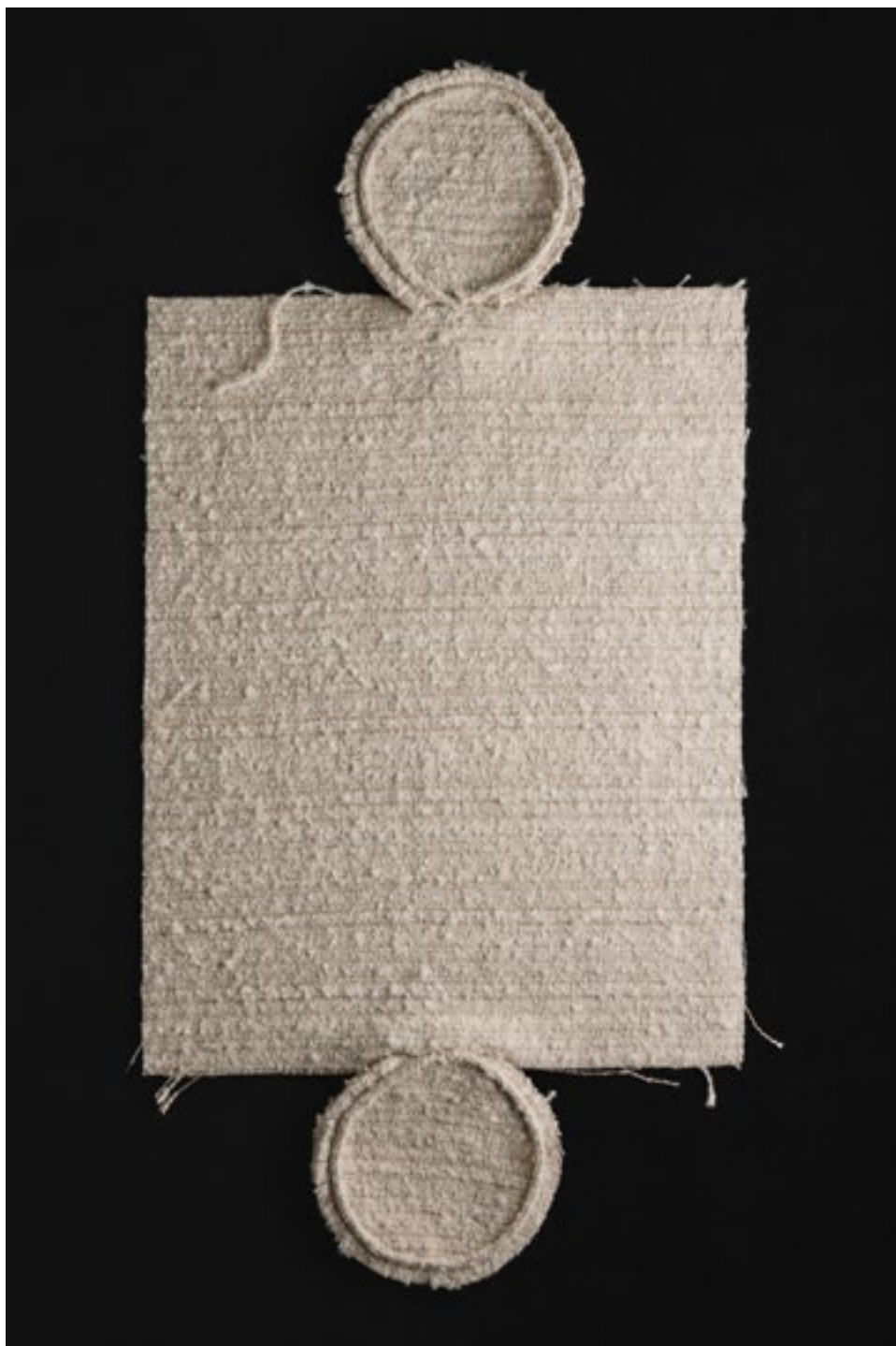
Sequoia, Bouclé texture , col. 1 Naturale