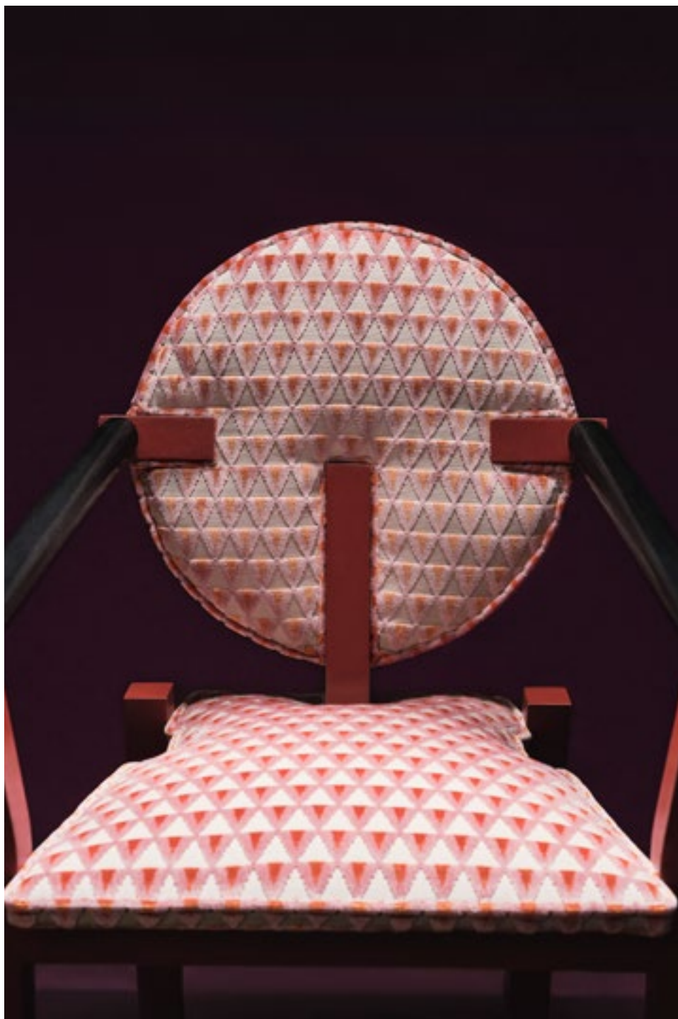
Amuleto, Lively geometric-patterned velvet, col. 3 Corallo