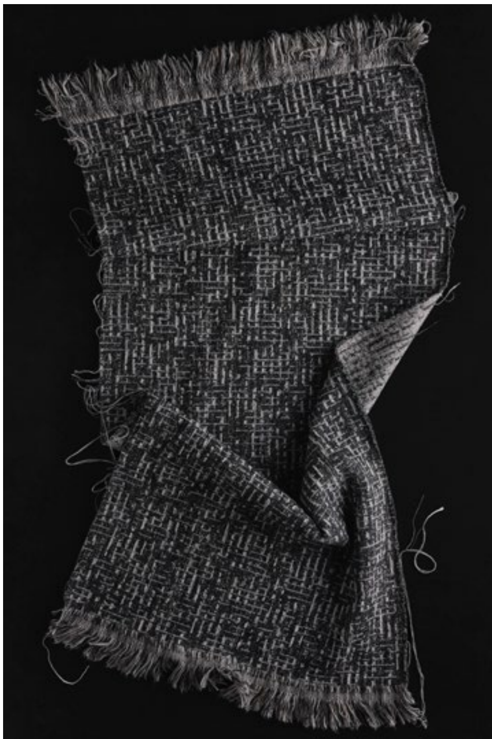
Esperanto, Black on white textural jacquard , col. I Quasinero