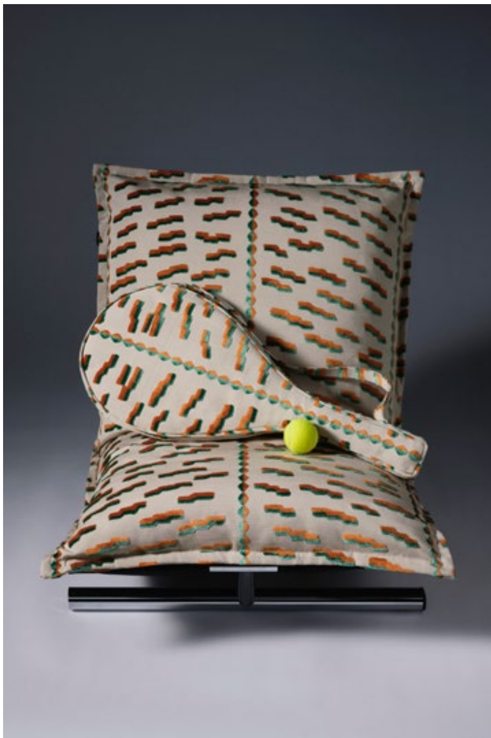
Tiger Beat, Jacquard velvet with tiger coat , col. 4 Papaya