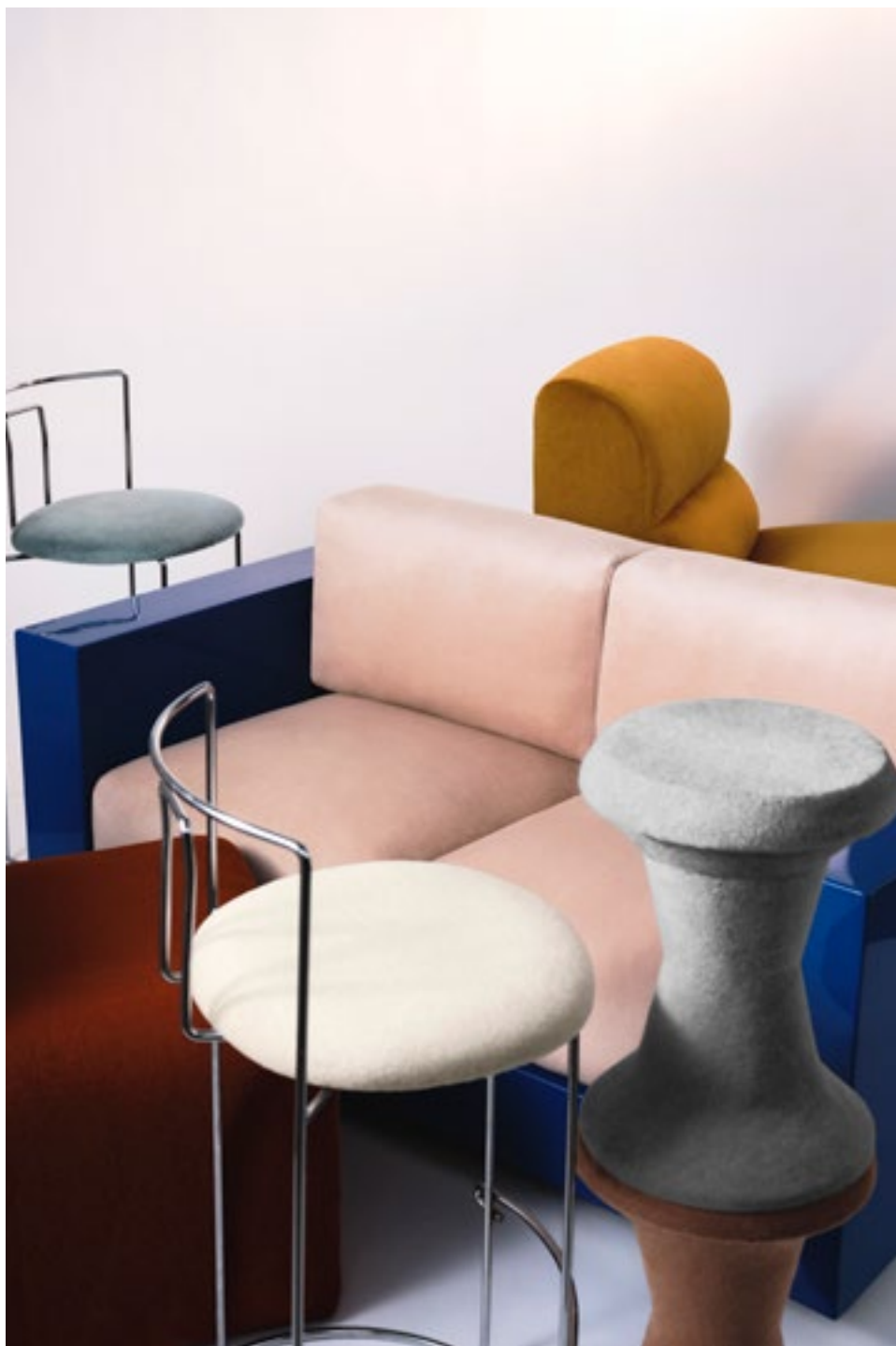
Adorabile Alpaca, Alpaca velour , col. 3 Argento, 5 Sabbia, 7 Camel, 8 Nude, 9 Celadon, 14 Red fox, 16 Moutarde