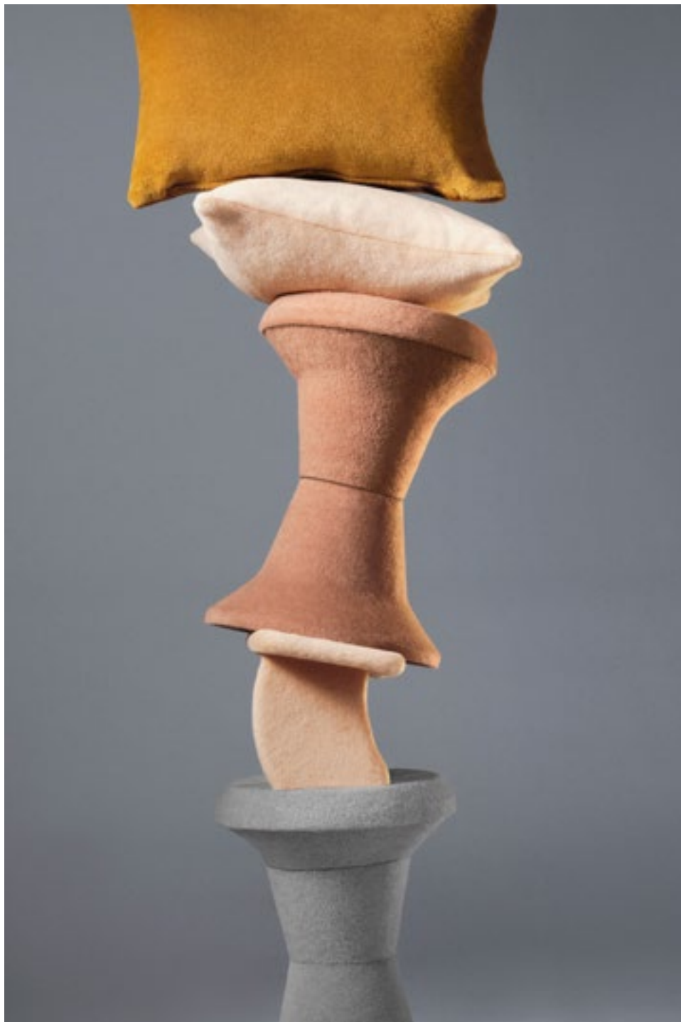
Adorabile Alpaca, Alpaca velour , col. 3 Argento, 4 Banguise, 7 Camel, 5 Sabbia, 16 Moutarde