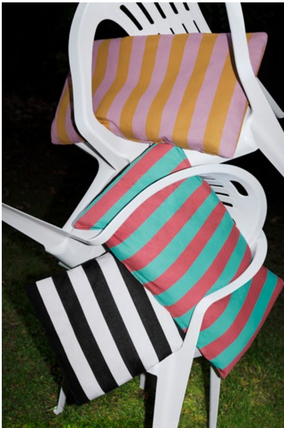
Belmondo, Vibrant stripes , col. 1 Cristallo nero, 7 Ametista, 9 Turchese navajo