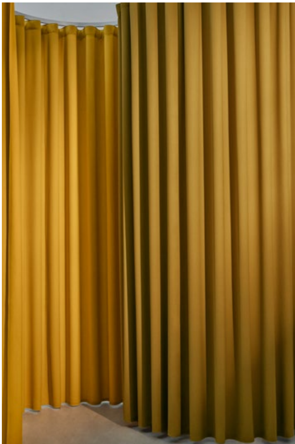
Aplomb, Wool satin , col. 43 Girasole, 44 Moutarde