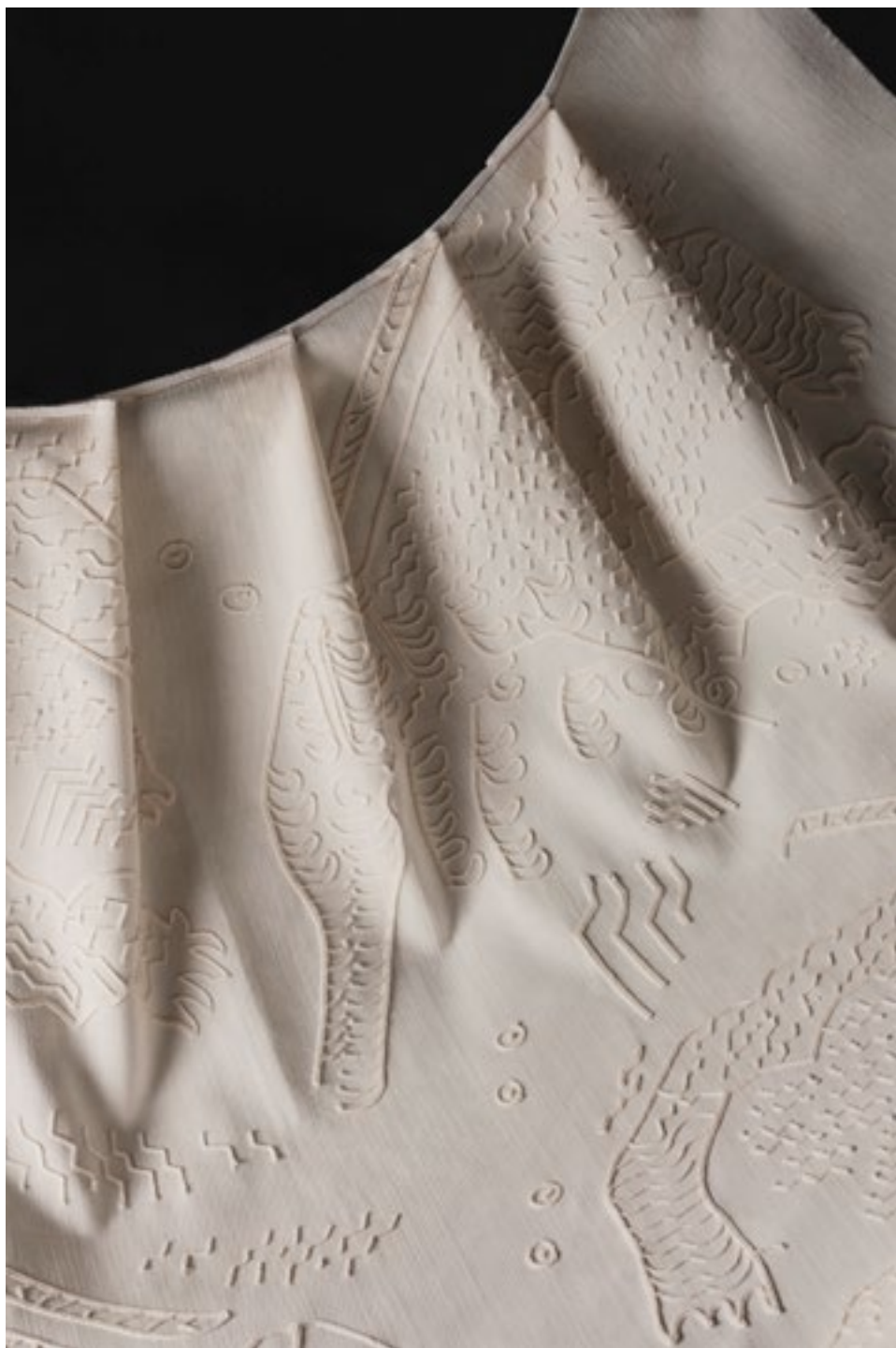
Tiger Snow, White-on-white embroidery , col. I Snow