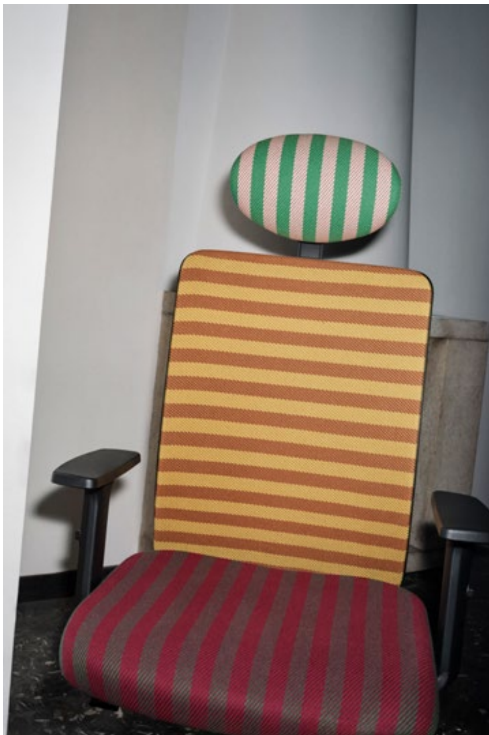
Voulez-vous, Striped twill , col. 5 Fragola menta, 6 Girasole, 8 Agrifoglio