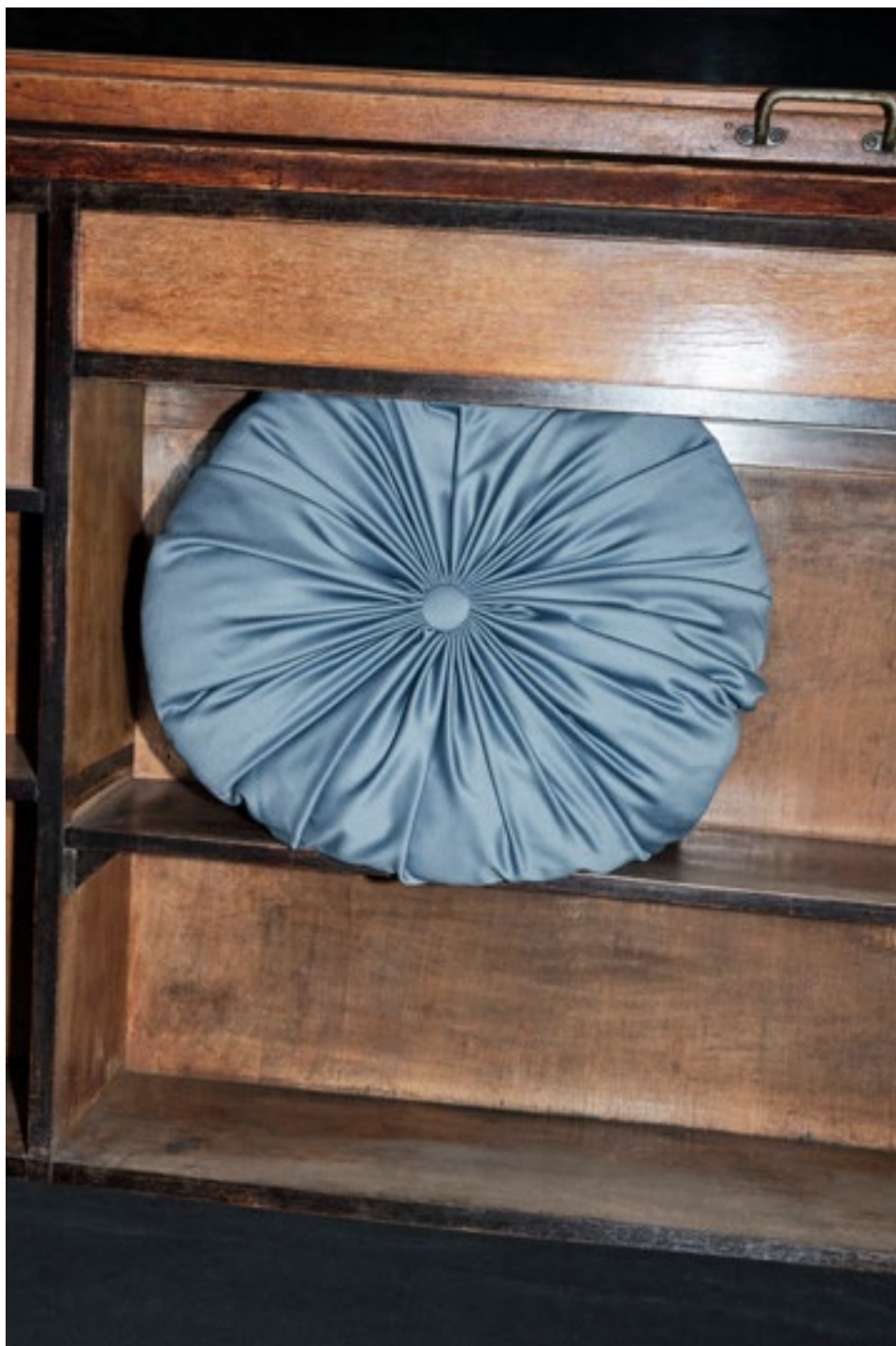
Aplomb, Wool satin , col. 33 Bleu nattier