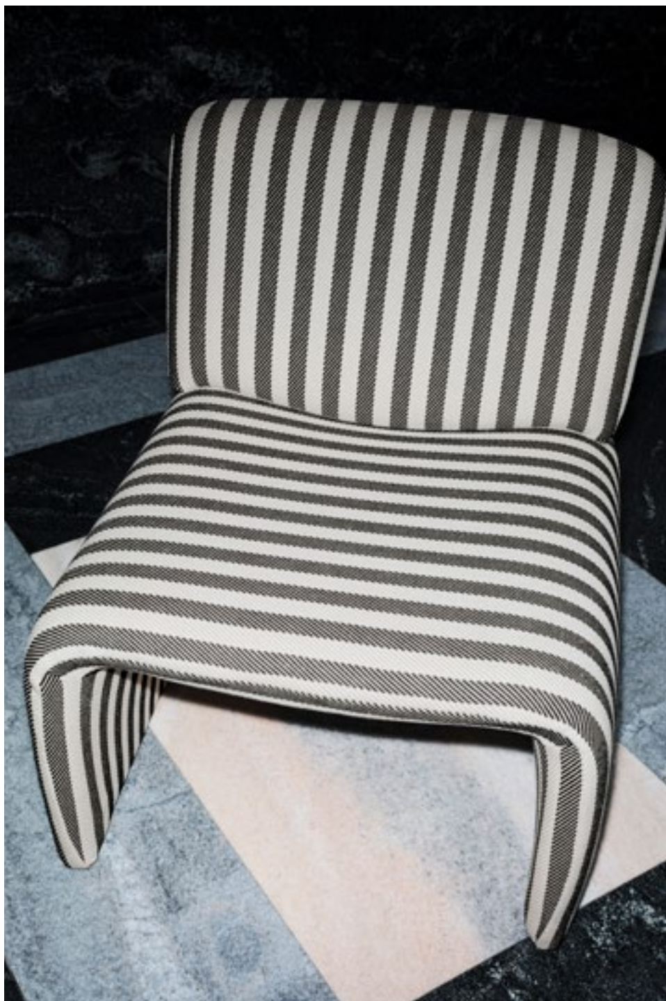
Voulez-vous, Striped twill , col. 3 Liquirizia bianca