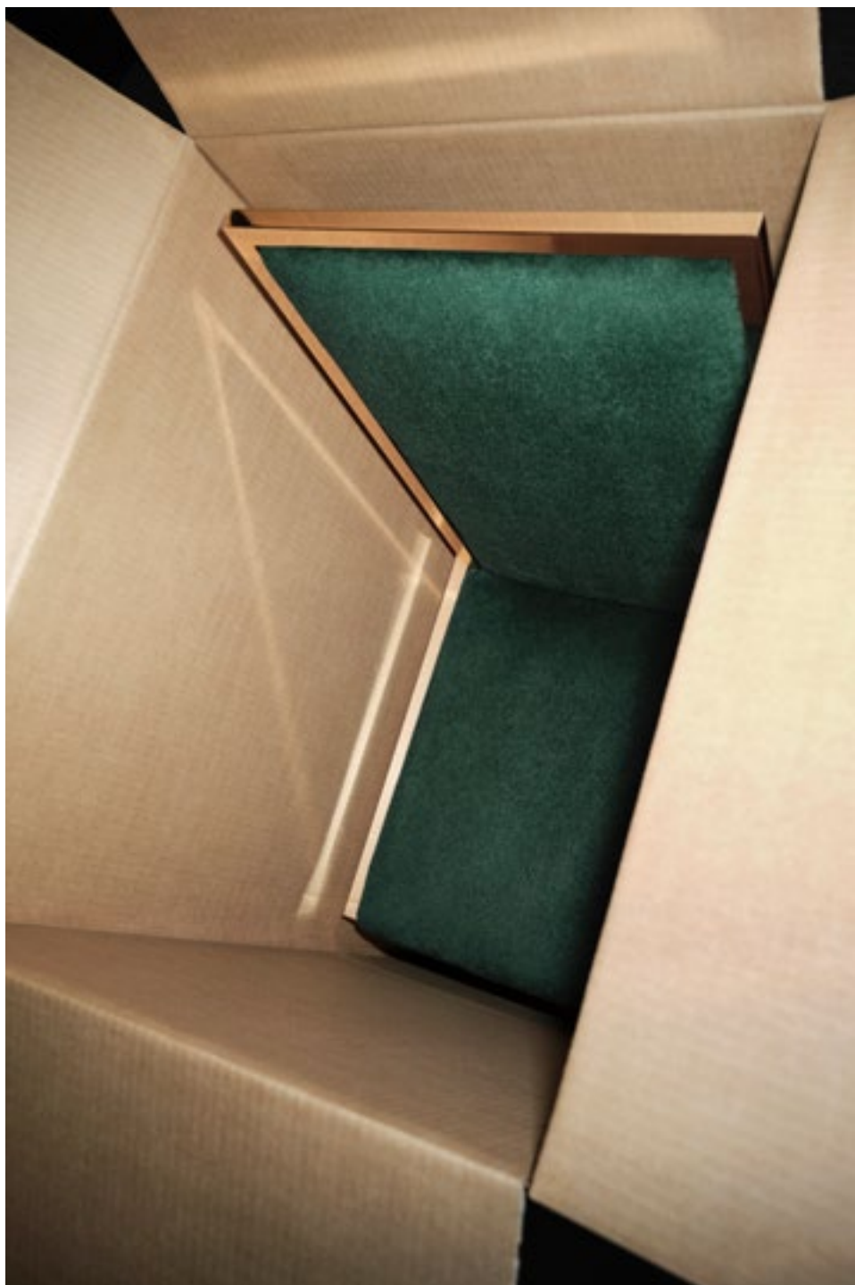
Adorabile Alpaca, Alpaca velour , col. 12 Foresta