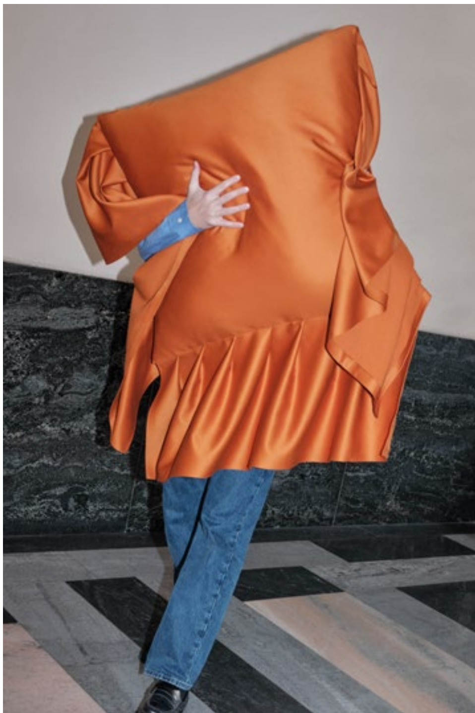
Aplomb, Wool satin , col. 42 Zucca