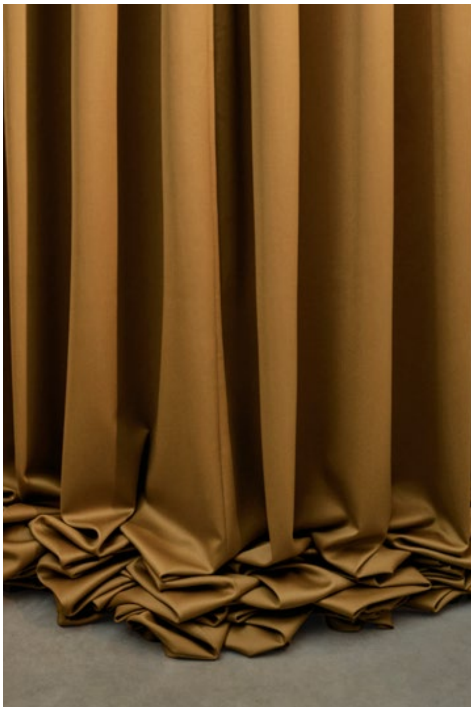
Aplomb, Wool satin, col. 44 Moutarde